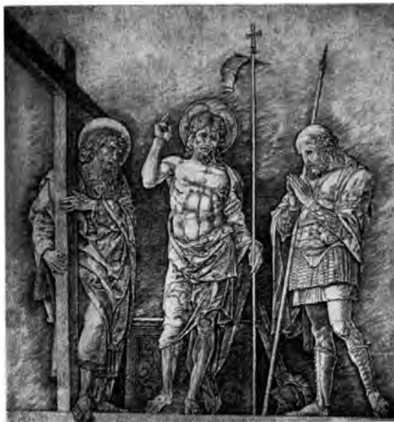
RESURRECTION OF CHRIST BY ANDREA MANTEGNA (1431-1506)